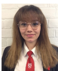
Kia Head Girl