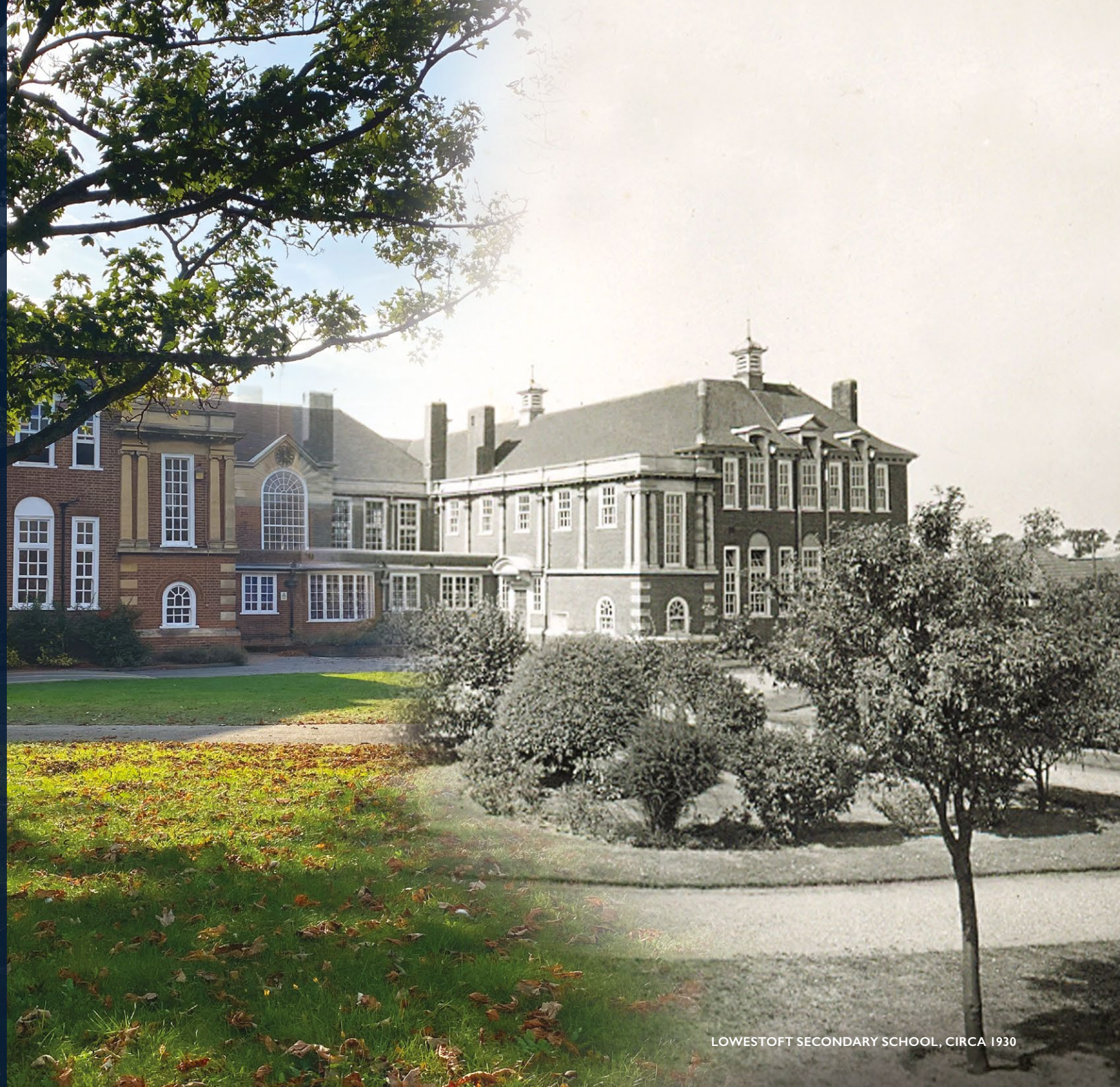
LOWESTOFT SECONDARY SCHOOL, CIRCA 1930

The main building, fronting onto the road, is still as beautiful as when it was built, but now has the mature trees to complement it.